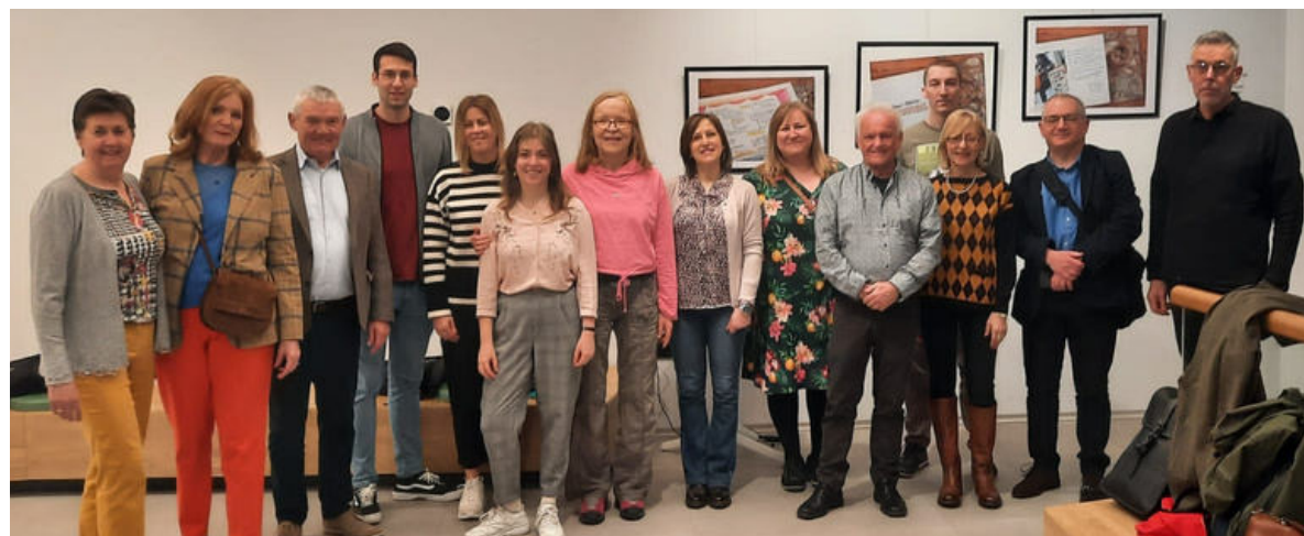
From the 23rd to the 24th of March, partners of the project “EXPECT” met for the 8th time. This time, the team met in Bilbao, Spain. A recap of each day can be found below.